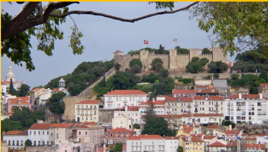
Castelo de São Jorge overlooking Lisbon, Portugal