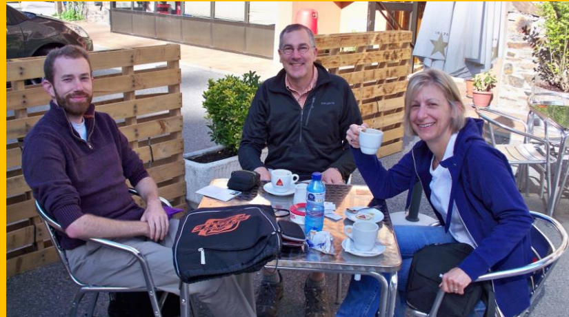
Powering up for a day in Andorra