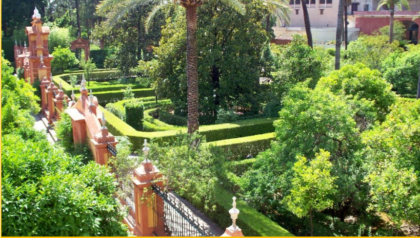
Gardens of the Real Alcazar, Seville