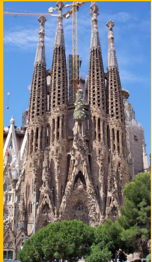
Sagrada Familia Basilica in Barcelona