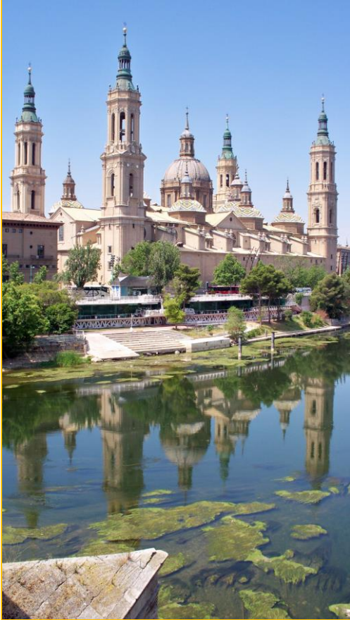
Cathedral-Basilica of Our Lady of the Pillar, Zaragoza