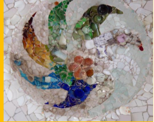
Detail of ceiling mosaic at Park Guell, Barcelona