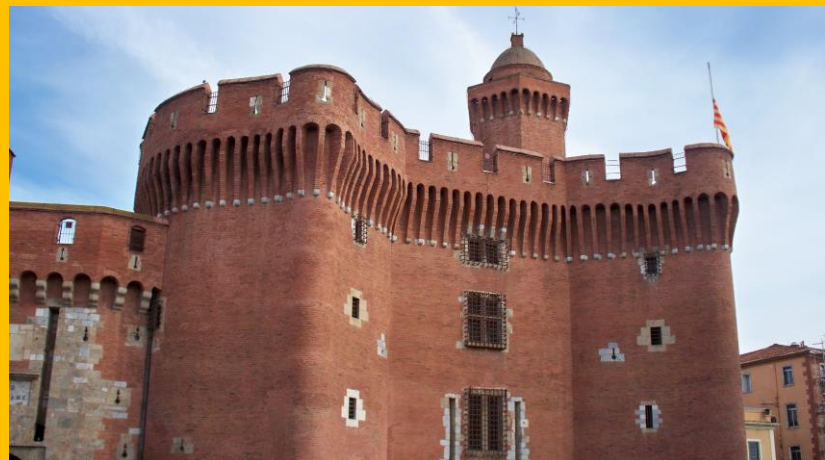
The Castillet of Perpignan, France