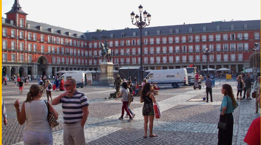
Plaza Mayor, Madrid