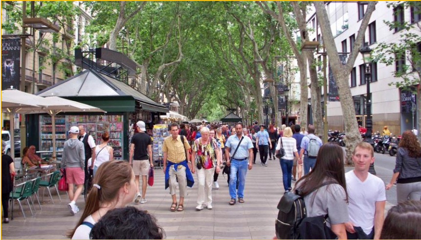
La Rambla in Barcelona