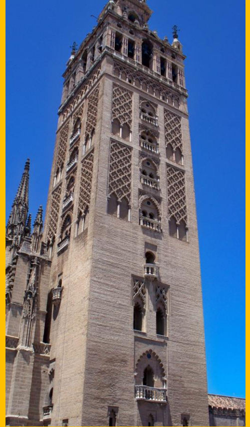
The Giralda bell tower of the Seville Cathedral