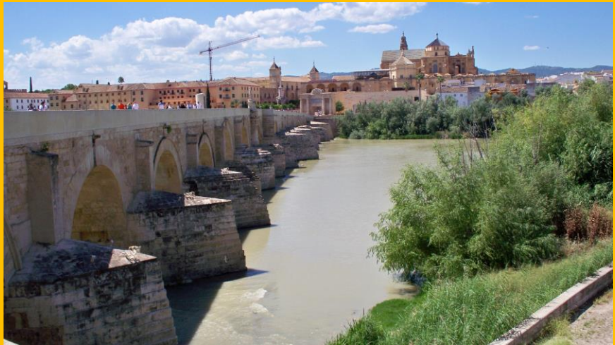
The Roman Bridge over the Guadalquivir River and the Mosque-Cathedral of Córdoba (Mezquita)