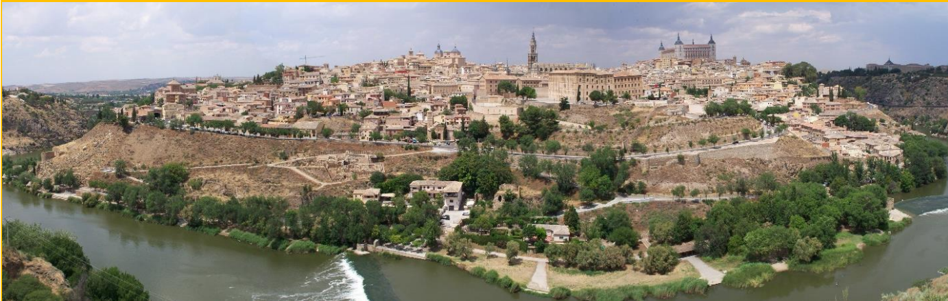
Toledo encircled by the Tagus River