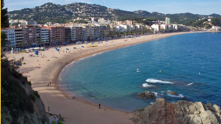
Lloret de Mar, Spain