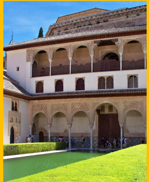
Inner courtyard of the Alhambra Palace in Granada