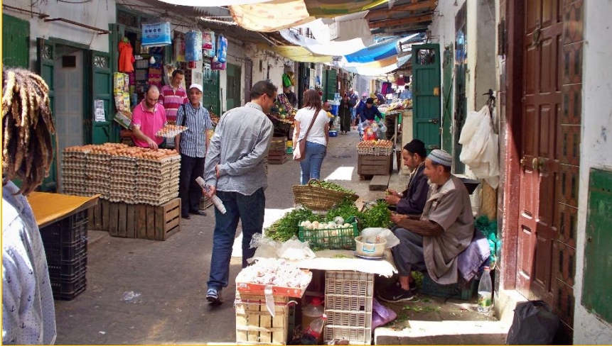
The medina of Tétouan, Morocco