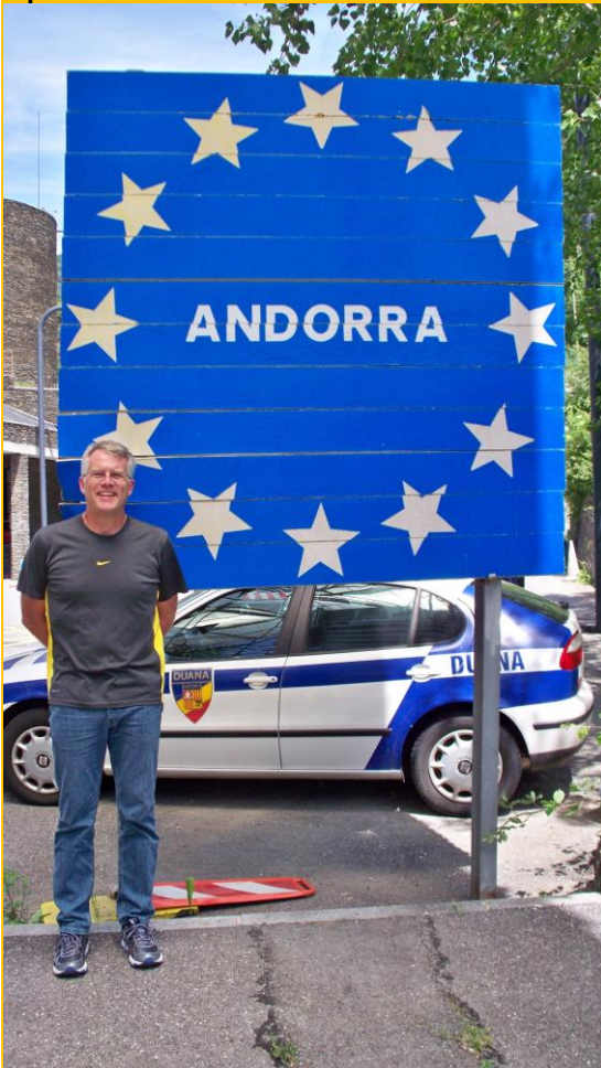
The sign is only slightly smaller than the actual country.