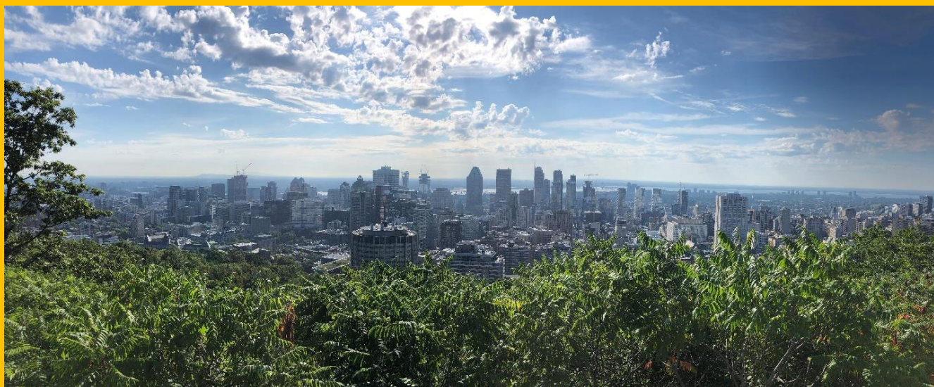
A view of Montreal from Parc du Mont-Royal