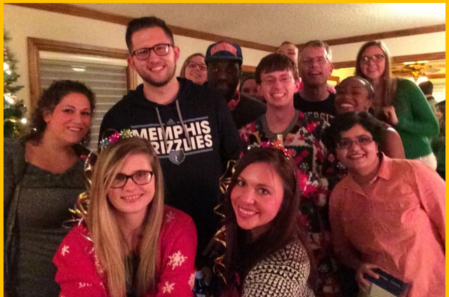
Recreating the famous “selfie” photo from last year’s Oscars