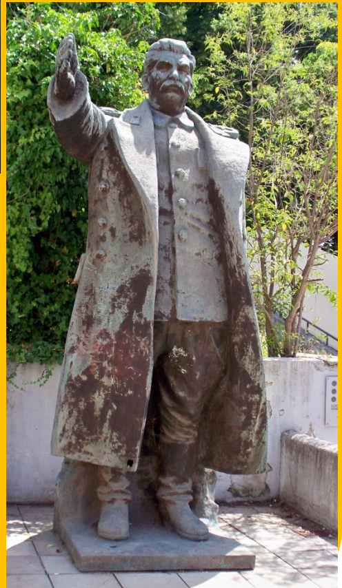
Welcome to Tirana!