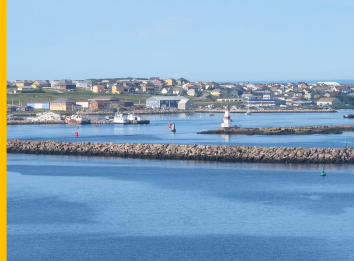
Views (below) of Reykjavik from the Perlan