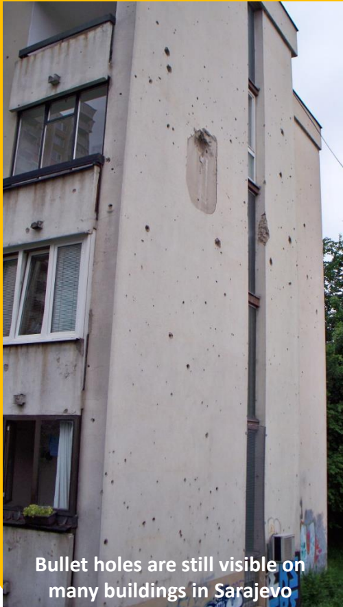
Bullet holes are still visible on many buildings in Sarajevo

They then flew to Rome to meet the arriving students, and toured Rome for a few days. En route to the port of Bari, they toured Pompeii, and then ferried over to Durrës, Albania to disembark and continue their trip. They had a few hours in Tirana, spent a night in Budva, Montenegro and visited the port town of Kotor, and then overnighted near Dubrovnik and toured the walled city the next day. The last two days of the trip were spent getting up to and across the island of Hvar, spending a night there and touring the city, before retracing their steps back to the Dubrovnik area for one last night before flying home on June 13 via Frankfurt, Germany.