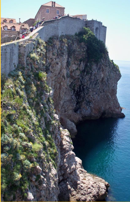
Walls of Dubrovnik

To get to Hvar from Dubrovnik, we had to pass through the Neum corridor, a sliver of territory on the coast possessed by Bosnia. Then a ferry took us to the eastern end of Hvar (Sućaraj), and finally a winding 2-hour bus ride across the 41-mile length of the island to the city of Hvar on the western tip.