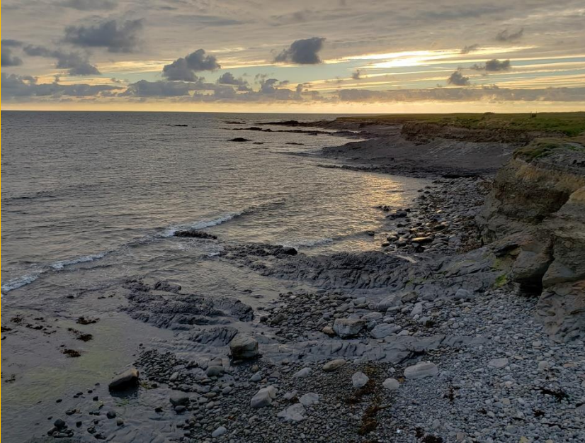
Sunset on Spanish Point (above); Caherconnel Ring Fort herding dog demonstration (below).