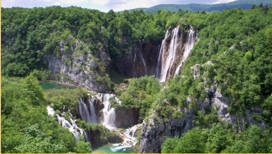
Plitvice Lakes National Park, Croatia