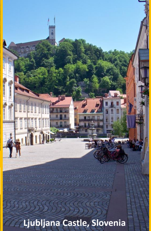
Ljubljana Castle, Slovenia