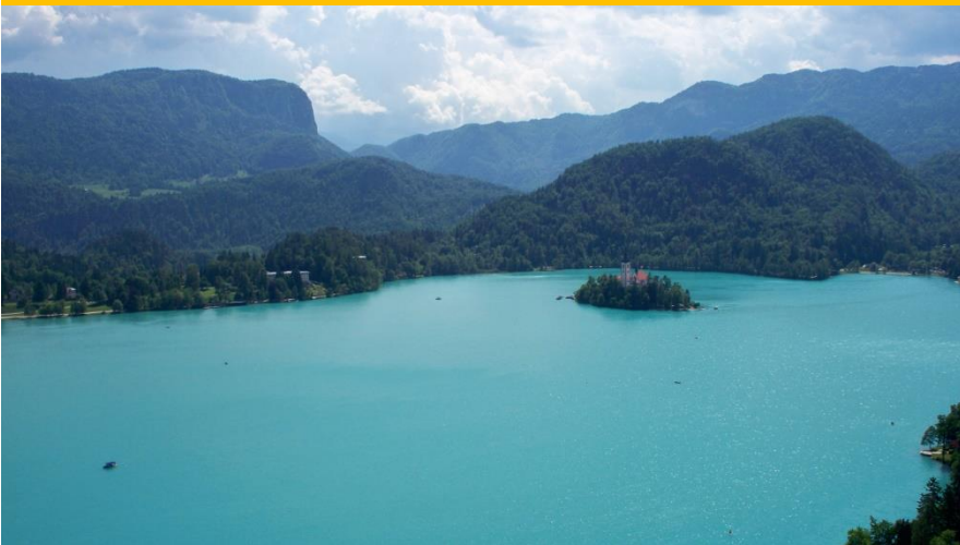
Lake Bled, Slovenia