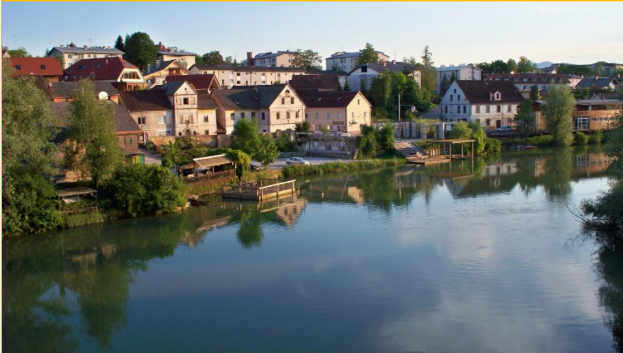
Novo Mesto, Slovenia