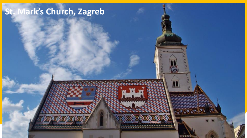
St. Mark's Church, Zagreb