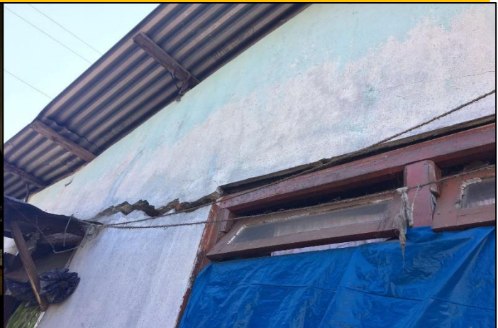
Cracks in houses still lived in in Makaibari Tea Plantation.