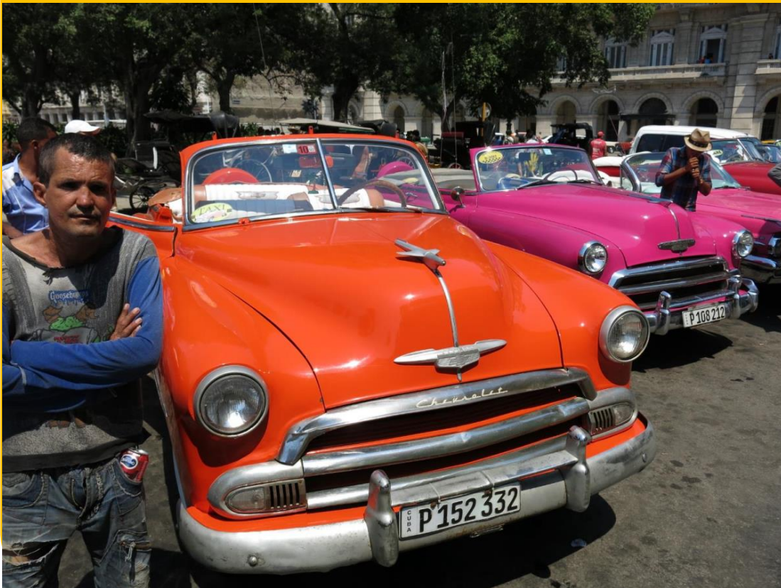
Old American cars, Havana, Cuba