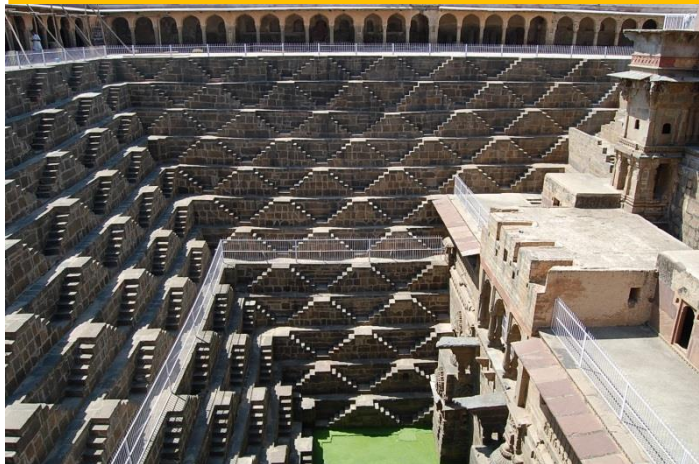
Chand Baori stepwell in Abhaneri, Rajasthan