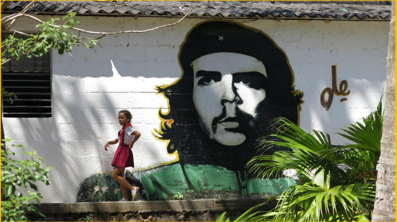
Che Guevara on the side of an elementary school, Las Terrazas, Cuba