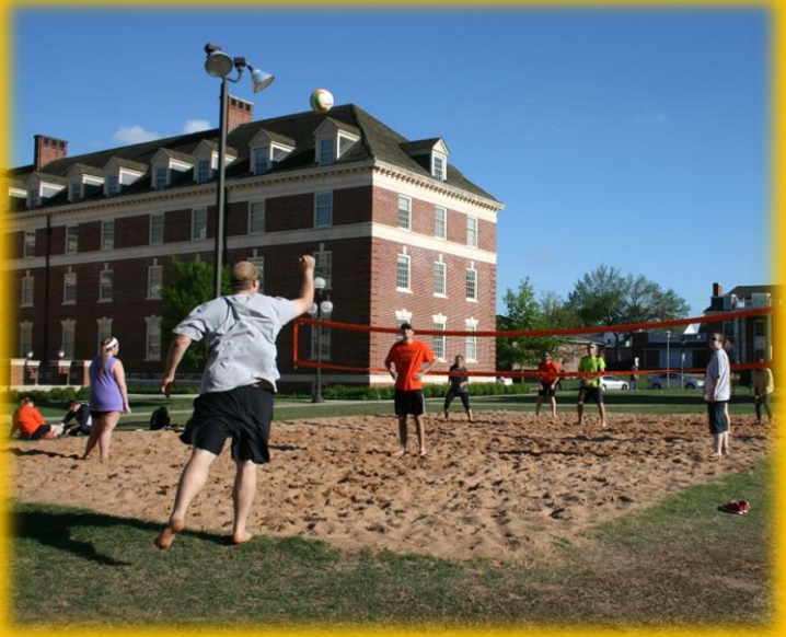
Geographers hit the volleyball courts several times in April for some fun.