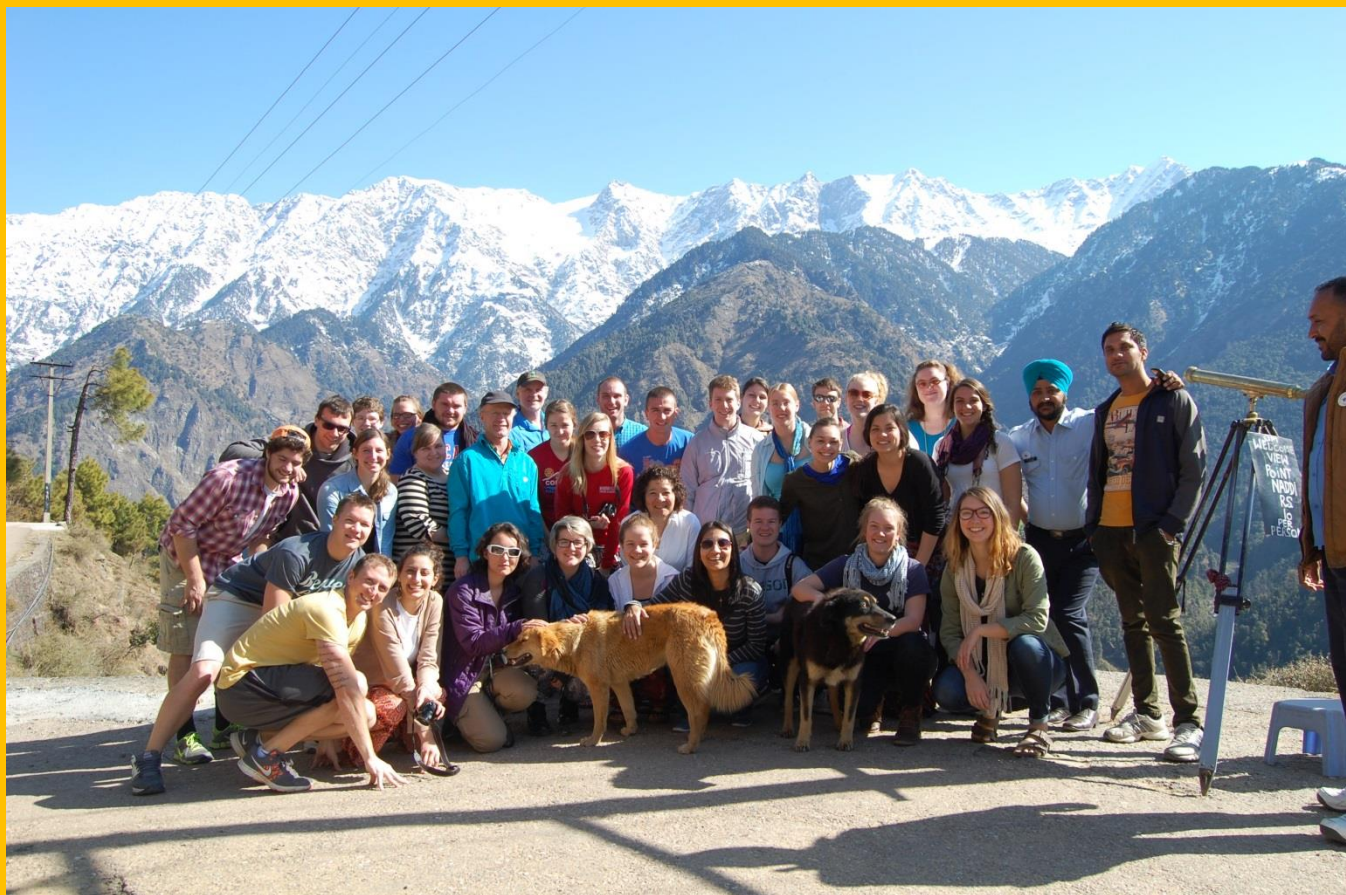
Dauladhar Range in Dharmshala, North India