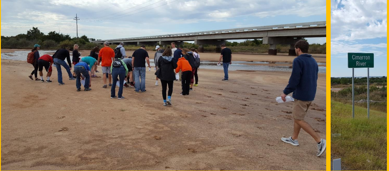
Becoming muddy boots (tennis shoes and sandals, really) geographers in the Cimarron River basin

The semesterly excursion into the wilds of western Oklahoma, otherwise known as the GEOG 1114 (Physical Geography) Field Trip, went off without too many hitches. The Monday group got to peer inside a wind turbine thanks to the amazing negotiating skills of the newsletter editor, and the weather was decent all three days October 10-12.