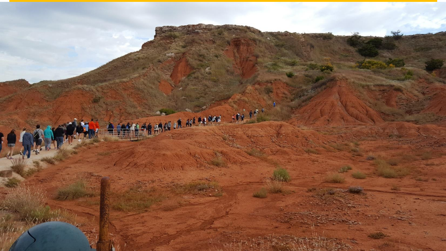
Trekking up the Glass (Gloss) Mountains