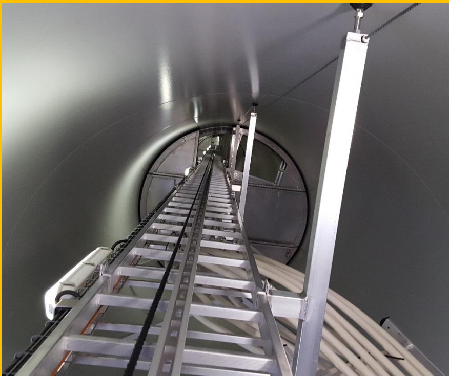
It's a long way to the top of a wind turbine! Did the editor climb all those steps? He's not telling...