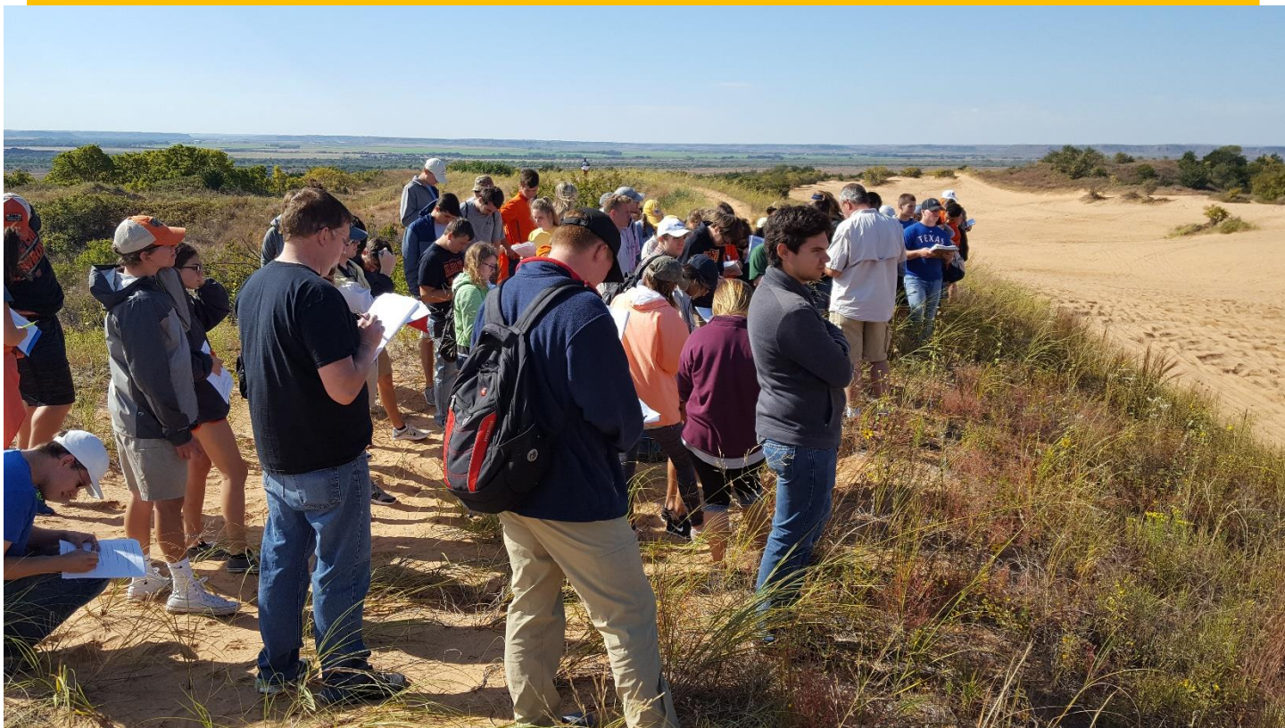
Watching the dune buggies at the Little Sahara State Park