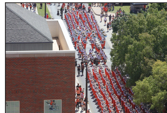
CMB in parade to the stadium