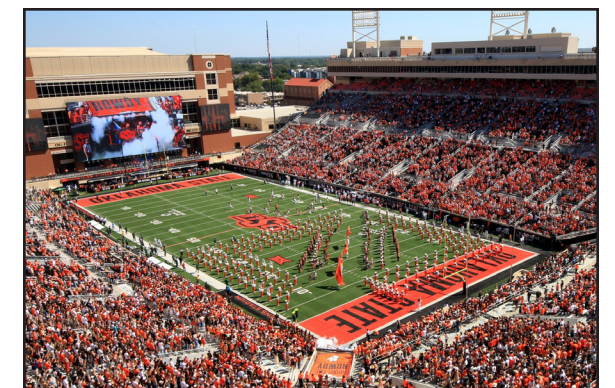
Team entrance in Pregame