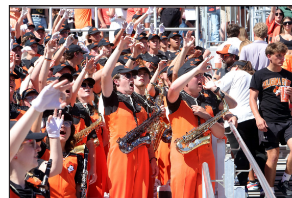
The CMB supports the Cowboys!