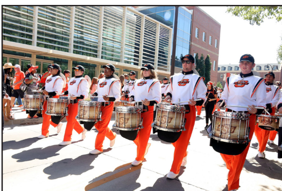
Snare Drums in the Walk