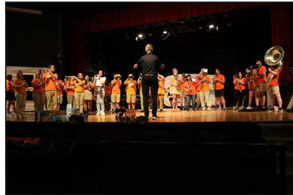
Alumni Band rehearsal at the Seretean Center