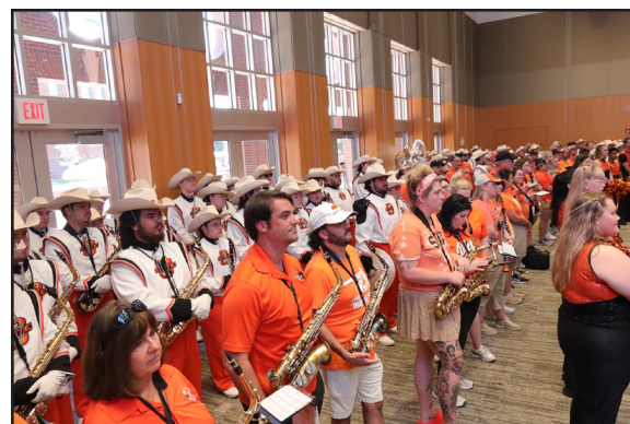
Alumni Center performance with CMB and Alumni Band