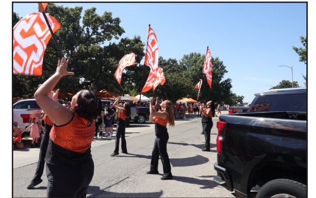
The Color Guard debuts their new flags