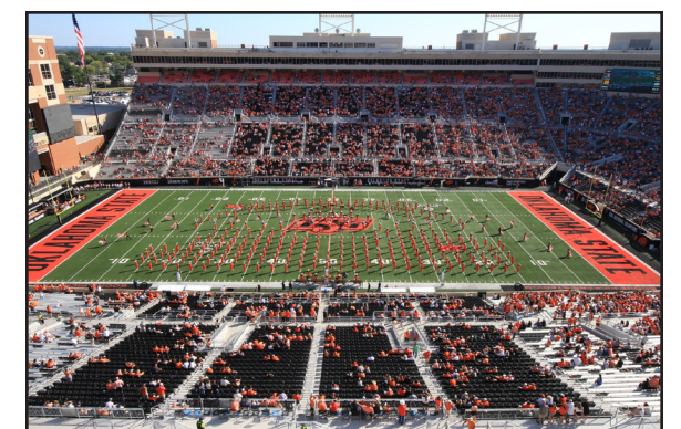
CMB in formation during halftime