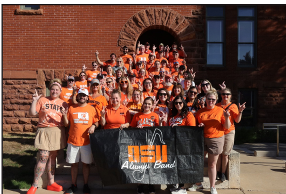
Members of the OSU Alumni Band in attendance for this year's event