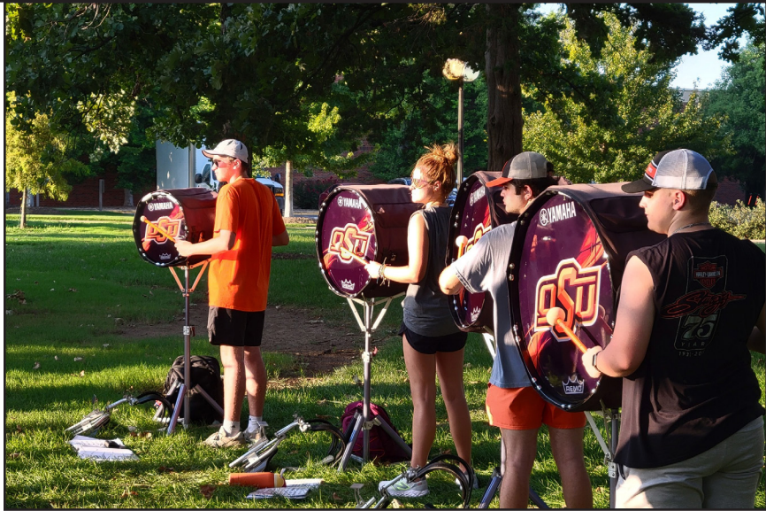
Drumline practice on the opening day of preseason camp