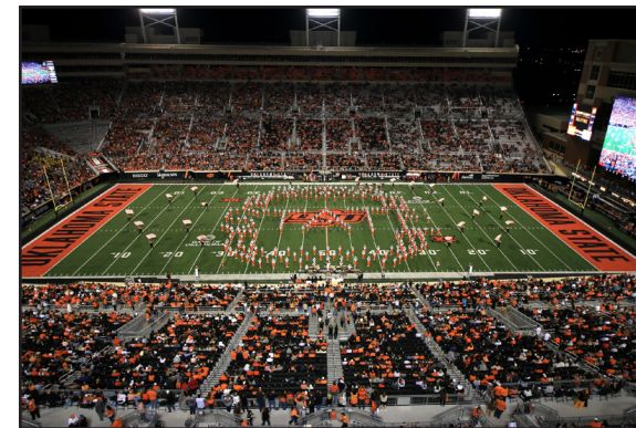
...continuing with the "O-State" logo...