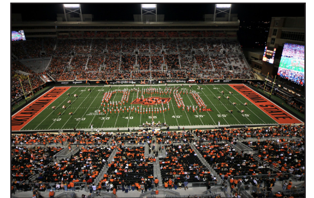
...and finally, a version of the OSU brand.