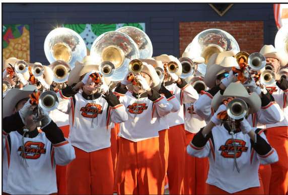
CMB brass warming up for the Sea of Orange Parade