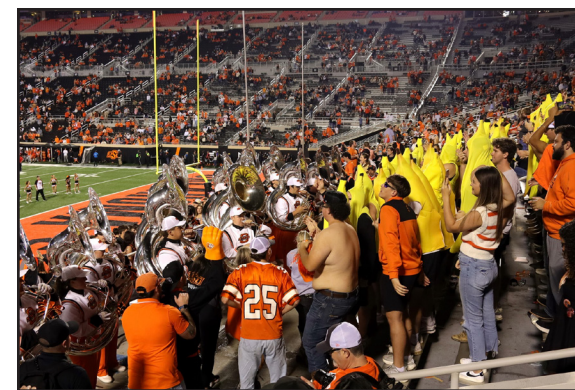
The tuba section serenaded "Pete's Peelers" with "Spain"