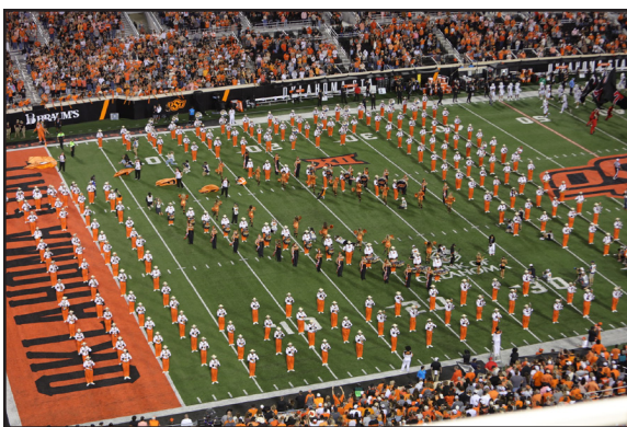
Team Entrance Tunnel in Pregame