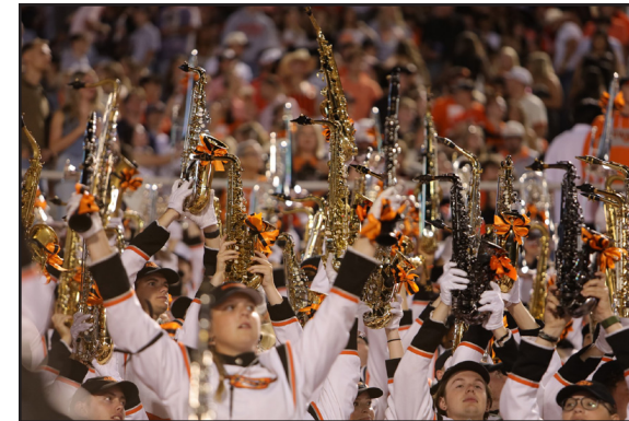
Horns in the air to cheer for the Pokes!