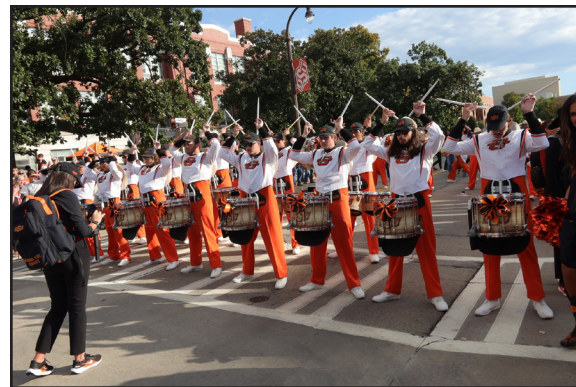
Drumline performing "Martian Mambo" at the Walk