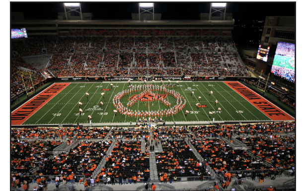
Highlighting logos of the past during halftime, starting with the O-A...