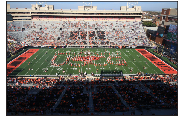
...followed by the Coast Guard...