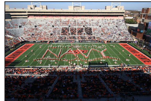
...then the Navy...