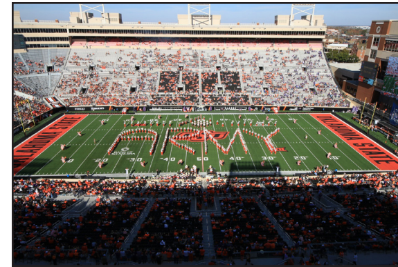
Representing the branches of the US Armed Forces, beginning with the Army...