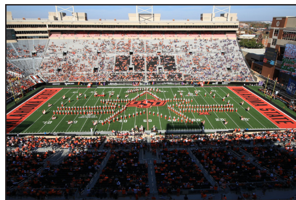
Honoring our veterans in "Salute to Service"