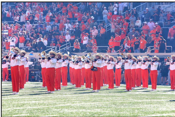
Pregame, with a segment of brass facing the north side stands