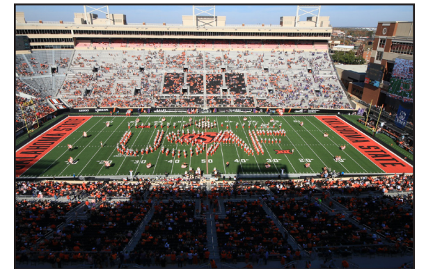
...then the Air Force and Space Force...