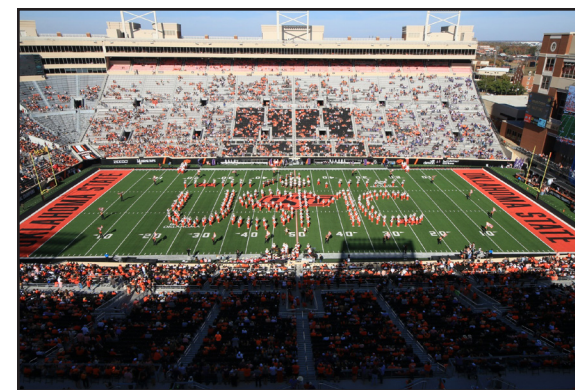
...and closing with the Marine Corps and recognition of its 250th anniversary