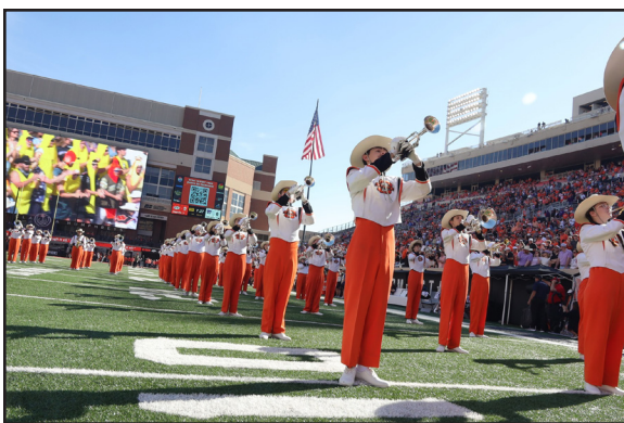
Moving into the Block O/Team Tunnel formation