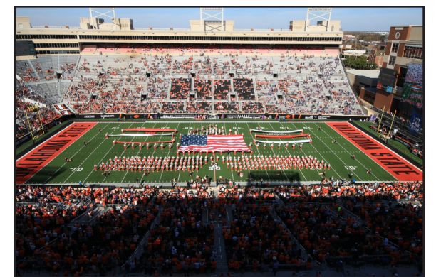
Closing the "Salute to Service" with the presentation of the American flag