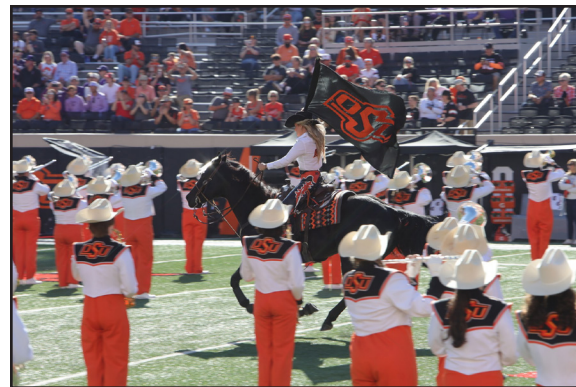
Bullet running through the band in Pregame