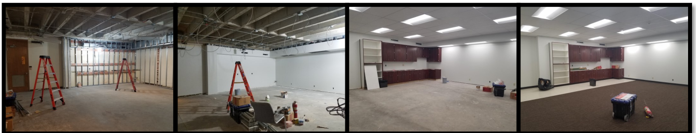
An asbestos abatement also had to be done.