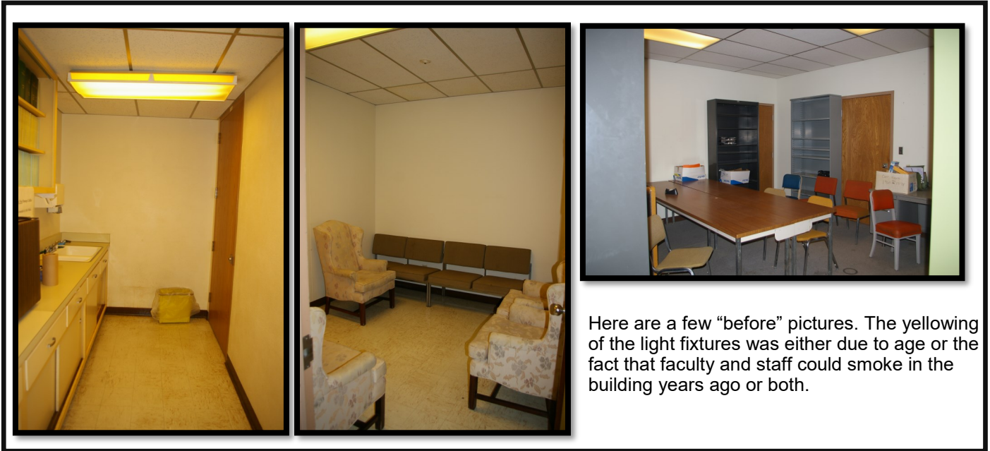
Here are a few "before" pictures. The yellowing of the light fixtures was either due to age or the fact that faculty and staff could smoke in the building years ago or both.